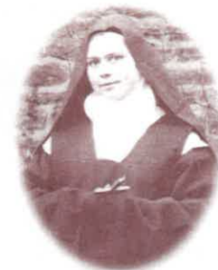
St. Elizabeth in 1903 with her Profession Crucifix

“O my Beloved Christ, crucified by love... I wish to love you even until I die of love.”